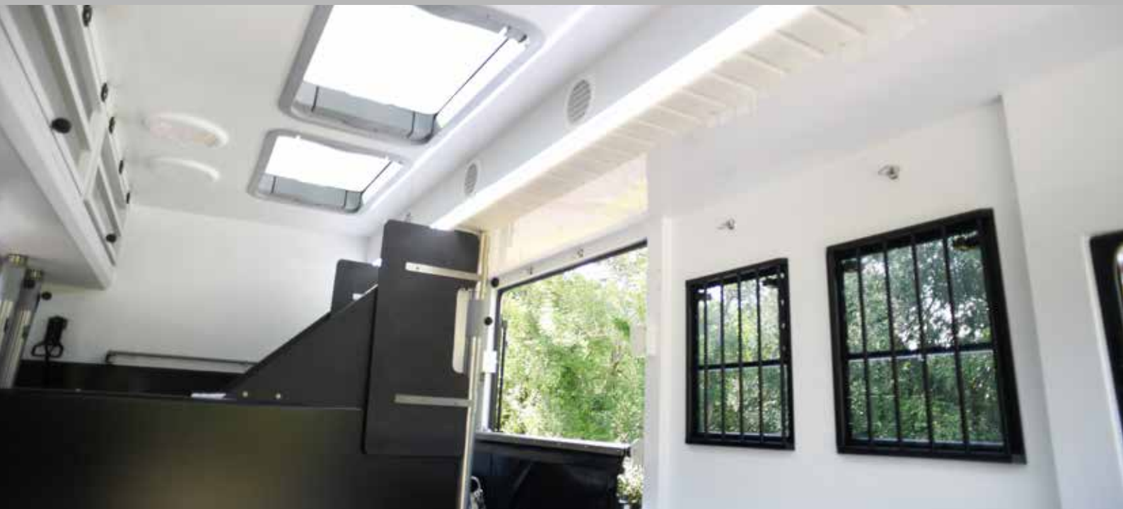
Large, clean, bright and spacious horse area with padded partitions