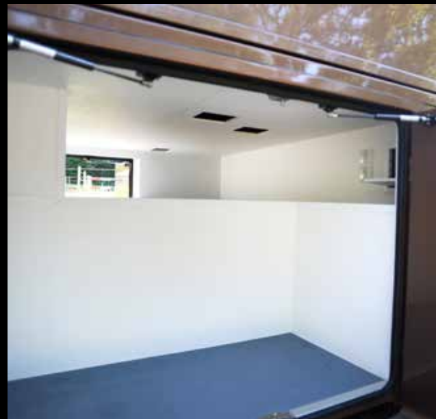
Slimline tack lockers in horse area, underslung to maximise space for saddles