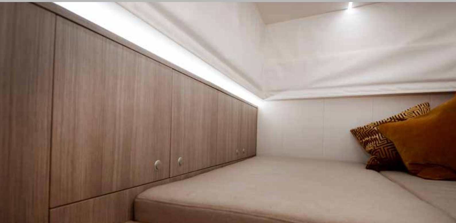
Beautiful living, bright, airy and spacious